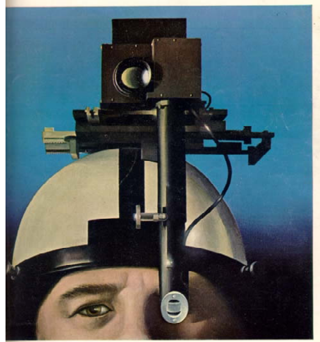
MOVEMENTS OF THE EYE